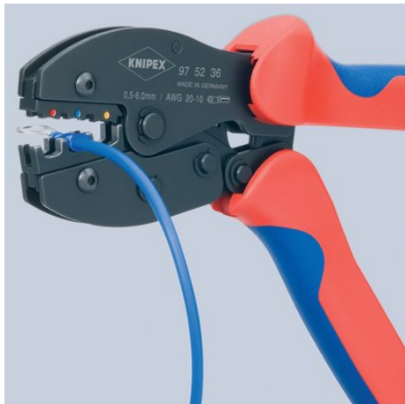
97 52 36