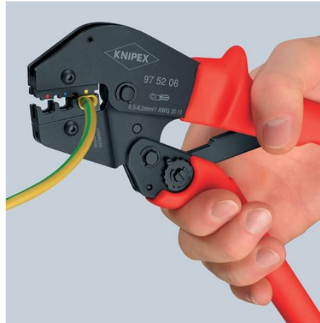
Second step: now use the whole hand for further crimping procedure