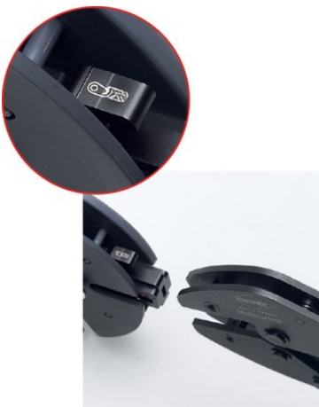
Clearly visible marking on the crimping dies with pictograms