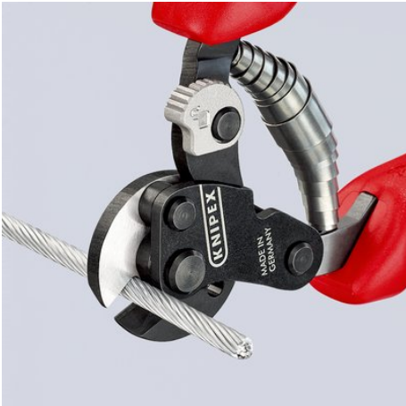
Cutting of high-strength wire ropes (1960 N/mm 2 ) of up to Ø 4 mm