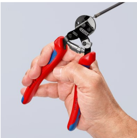
Compact at 160 mm but nevertheless more powerful than many larger wire rope cutters