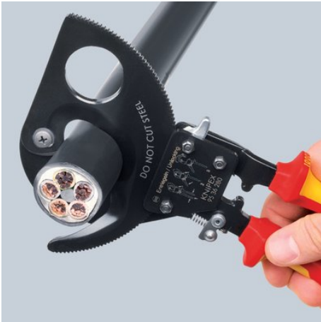
Ratchet principle and two-stage ratchet drive for easier cutting