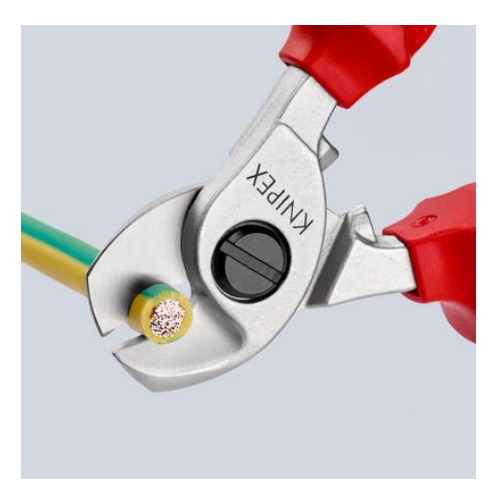
Cut performed with a Cable Shear: easy, clean cut without any deformation of the cable