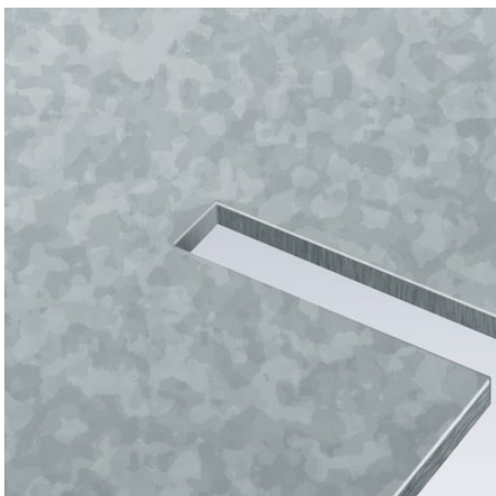
Notching and chip breaking in a single pass