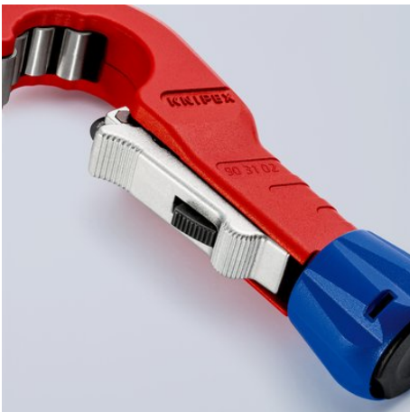
The spring-loaded cutting wheel can be pushed and fixed on the diameter of the pipe with the one-hand locking mechanism