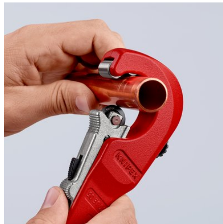
Push the cutting wheel against the pipe with the QuickLock one-hand locking mechanism: fastest adjustment to different pipe diameters