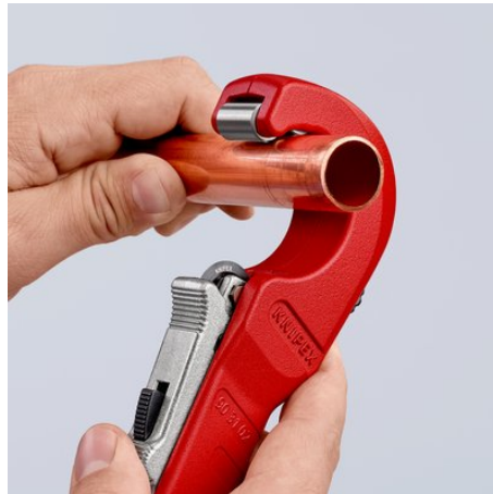
Cutting now made easy: position the opened KNIPEX TubiX®...