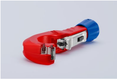
High-quality needle bearings enable the cutting wheel and the four guide rollers to operate virtually without any friction during the cutting – cuts stainless steel pipes with particular ease