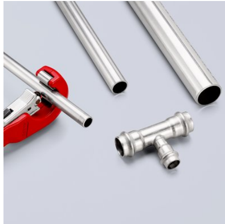
Speed in everyday operation: the QuickLock one-hand locking mechanism enables the cutting wheel to slide onto any pipe diameter with a single press of the thumb