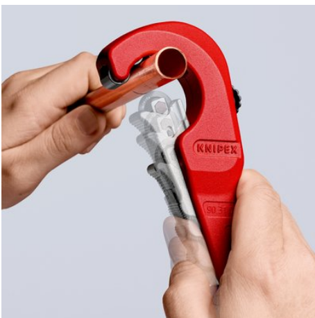
Cutting now made easy: position the opened KNIPEX TubiX®...