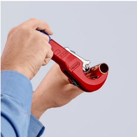
Tighten and cut with a swift twist and then readjust using the ergonomic blue feeding barrel...