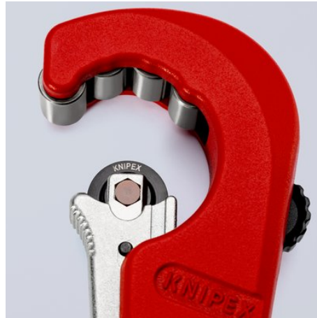
The needle-bearing and spring-loaded cutting wheel made of high-quality ball bearing steel is easily exchangeable