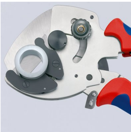
Clean cut of thick walled plastic and composite pipes