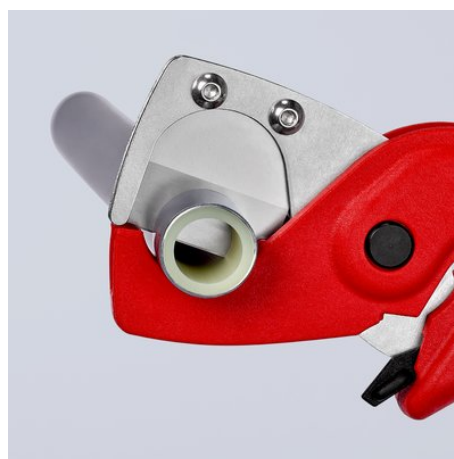
The high-strength, sharp blade cuts composite and plastic pipes smoothly and free of burr