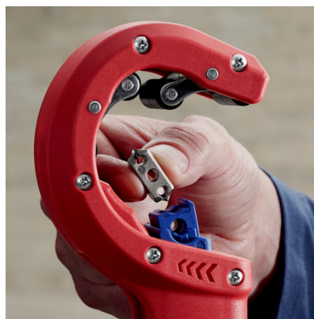
When worn, the blade can be reversed or replaced without the need for tools