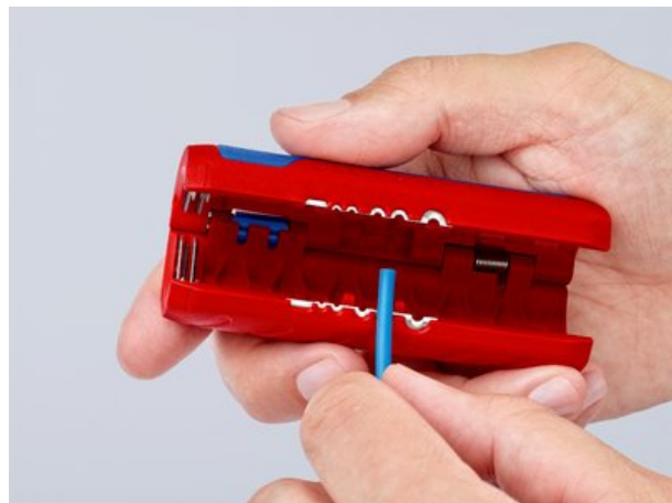
90 22 02 SB: Injection moulded length scale for consistent stripping to a uniform length, legible for left and right handed users