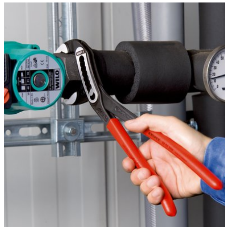
Self-locking on pipes and nuts: no slipping on the workpiece; the complete actuating force can be used to turn the workpieces; not having to squeeze the pliers handles reduces the required effort