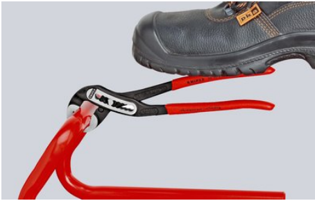
Self-locking on pipes and nuts: no slipping on the workpiece; the complete actuating force can be used to turn the workpieces; not having to squeeze the pliers handles reduces the required effort