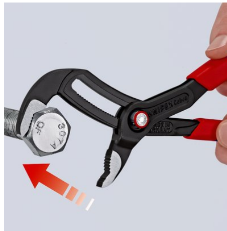
Position jaw – simply slide and close pliers