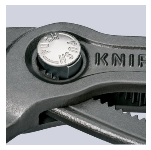
Fine adjustment by pushing a button: fast and comfortable.