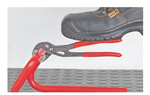
Teeth set against the direction of rotation have a self-locking effect and prevent slipping on the workpiece.