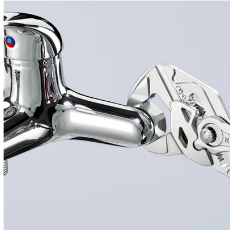
Working on plated fittings without damage of the surface