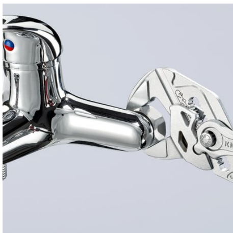
Working on plated fittings without damage of the surface