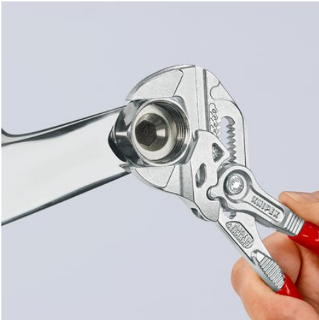
Working on plated fittings without damage of the surface