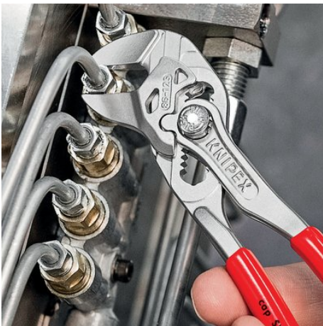
the mini pliers wrench for precision mechanics