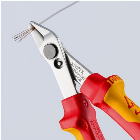
For use on live parts of up to 1000 V