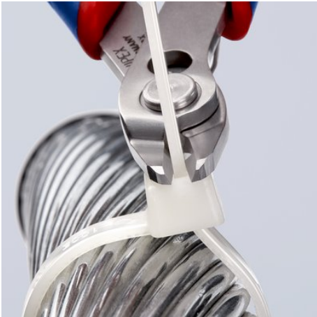
for flush cutting, e.g. for shortening cable ties