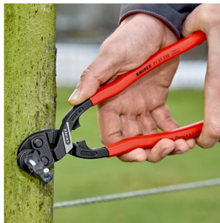
two-hand operation for maximum cutting force