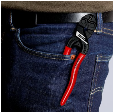
Compact, light and always to hand