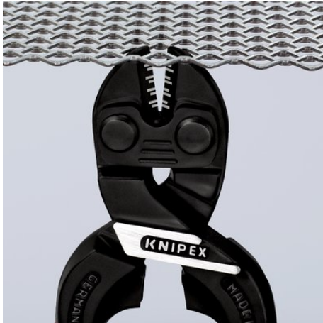
Slim head for ideal accessibility