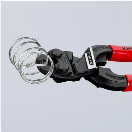
Powerful through to the tips