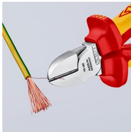
Clean cutting of thin copper wires, also at the cutting edge tips