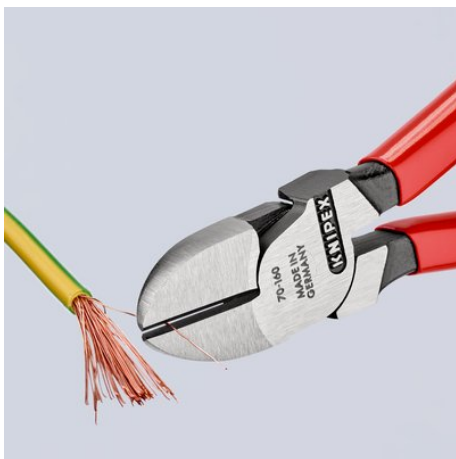
Clean cutting of thin copper wires, also at the cutting edge tips