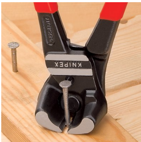
Almost flush cutting of bolts, nails etc.