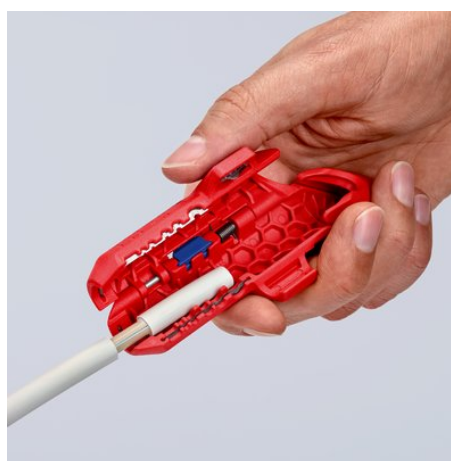
Stripping of a NYM cable