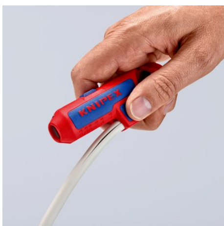
With concealed cutter in overhanging thumb rest on the side for convenient lengthwise cut