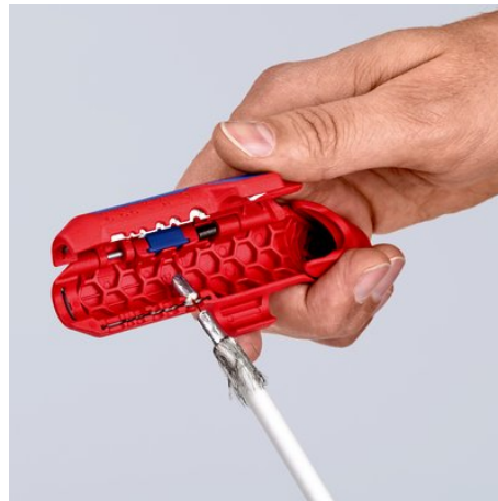
Stripping of a coax cable