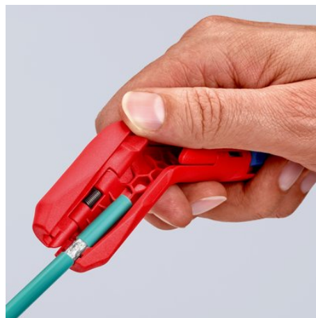
Stripping of a data cable