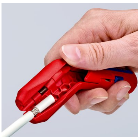
Stripping of a coax cable