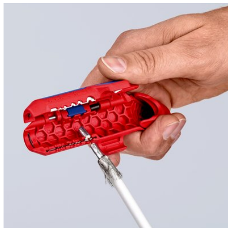
Stripping of a coax cable