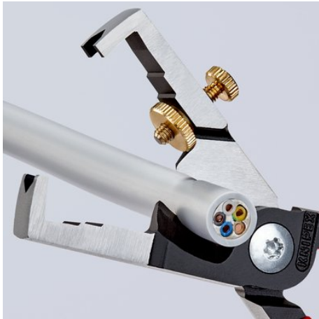
Induction-hardened precision cutter