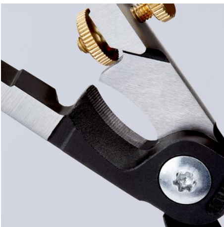
Induction-hardened precision cutter