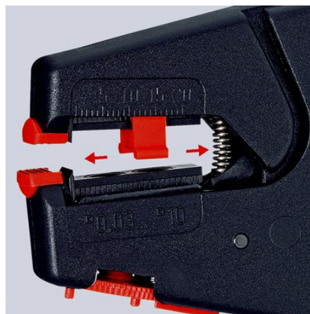
12 40 200: Adjustable length stop