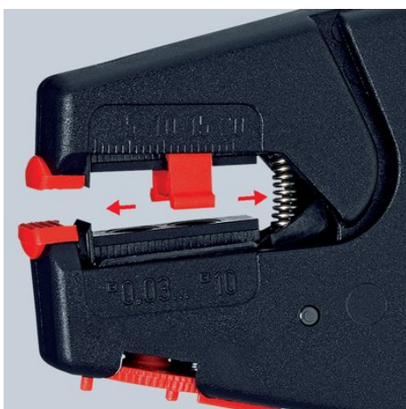
12 40 200: Adjustable length stop