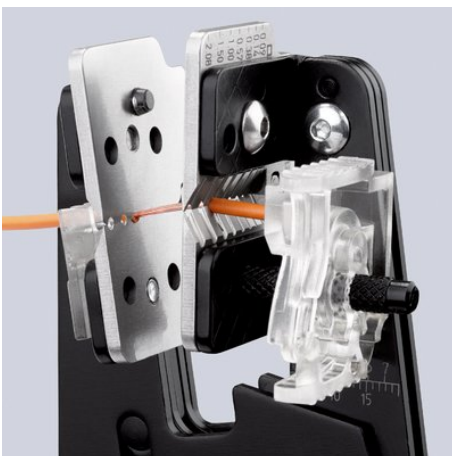
Positive stripping thanks to precise shape of the blades

Kapton® is a registered trademark of E. I. du Pont de Nemours and Company Radox® is a registered trademark of Huber & Suhner AG