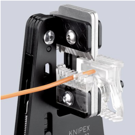
12 12 02 with cable guide and length stop