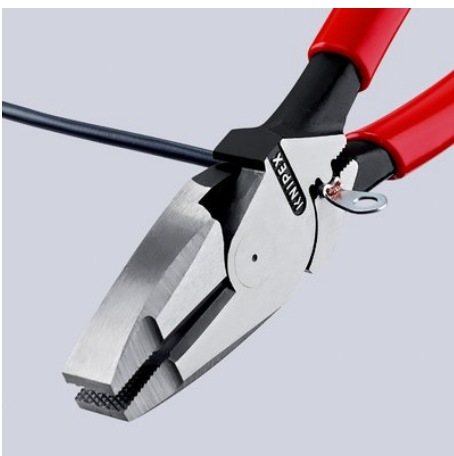
09 11/12 240: universal mandrel crimping area below the joint