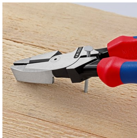
Gripping zone below the joint for powerful leverage