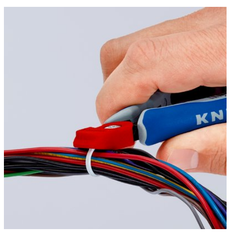
Remove the head of the cable tie using the Electronics Diagonal Cutter...