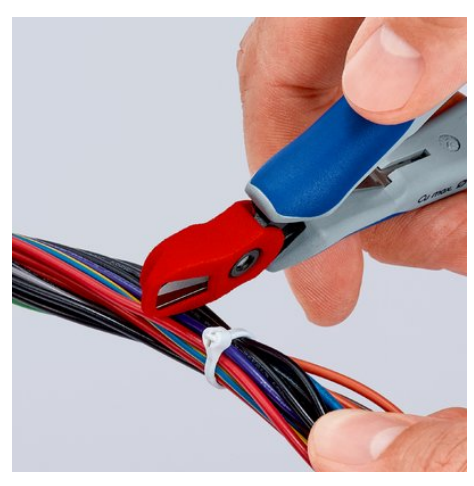
Easy attachment: the material catcher is easily attached and fastens securely to the pliers head